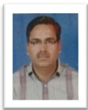
K.C. Joshi Computer Centre, Faculty of Education and Allied Sciences, M.J.P. Rohilkhand University, Bareilly